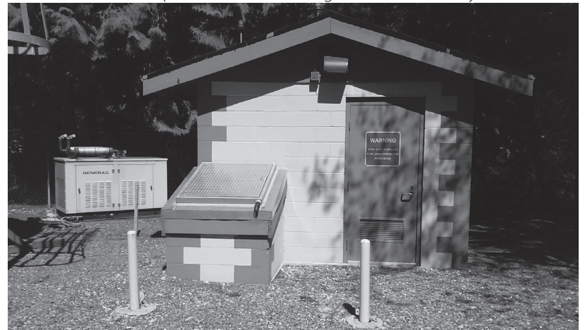
Braunwood Pump House

The annual water supply is limited by the water right certificate limit that was issued by the Department of Ecology and the system is not connected to the City's main water system and does not benefit from any other water sources. Therefore, water usage monitoring and conservation efforts are critical in the Hidden Valley Acres area to avoid emergency water restrictions, penalties, and potential shut-downs.